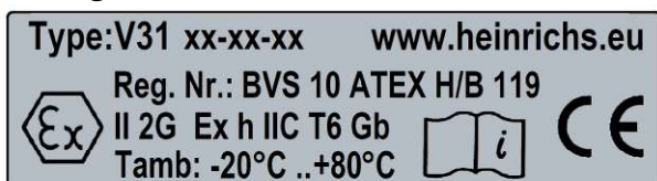
Marking plate for Gas atmospheres