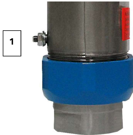
(1) connection screw for grounding

The transport of non-conductive liquids or gases in Variable Area Flow Meters can operationally lead to a charge separation inside the measuring tube. To ensure such electrostatic build-up are discharged, Variable Area Flow Meters must therefore be permanently grounded by the operator. If grounding is not viable via the process connections (e.g. plastic process pipes) the flow meter must be connected to the grounding screw [1], which is located at the rear instrument panel, via a cable to the local equipotential bonding.